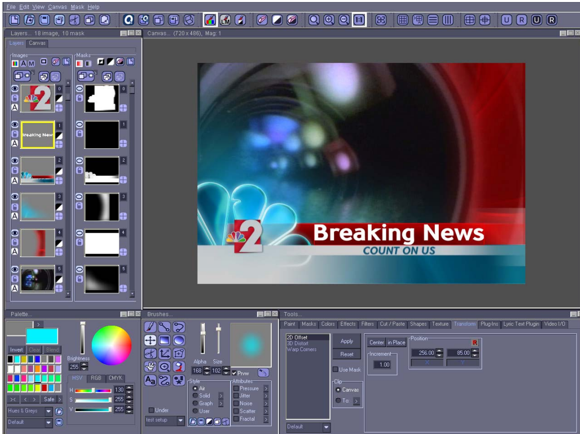
Twister's Easy To Use UI