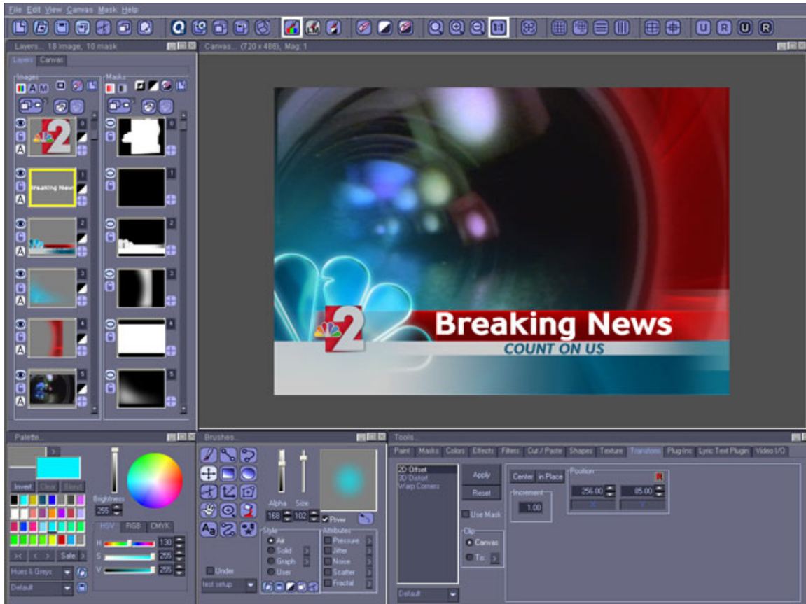
Twister's layer based graphics design UI

broadcasters face daily. The Twister's browser is rich with functional operating features which allow the operator to move content and use files between practically any related broadcast devices, regardless of whether they are open or proprietary in nature, local or remote. Many of these systems' metadata formats are also supported for creating and updating searchable database information. The Twister PaintStation on HDVG provides high quality SD/HD frame grab and output, along with the ability to key and preview graphics over incoming video.